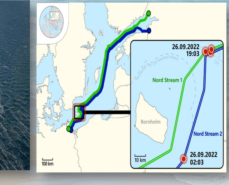
Figure 2 Nord Stream Cas attack locations

The widely publicized act of sabotage in September 2022 targeting the Nord Stream gas pipelines, which traverse the Baltic Sea from Russia to Europe, captured significant international attention. While the majority of media coverage centred on identifying the perpetrators responsible for the attack, little emphasis was placed on recognizing the inherent susceptibility of these offshore energy sources to intentional acts of aggression or other forms of potentially destructive harm.