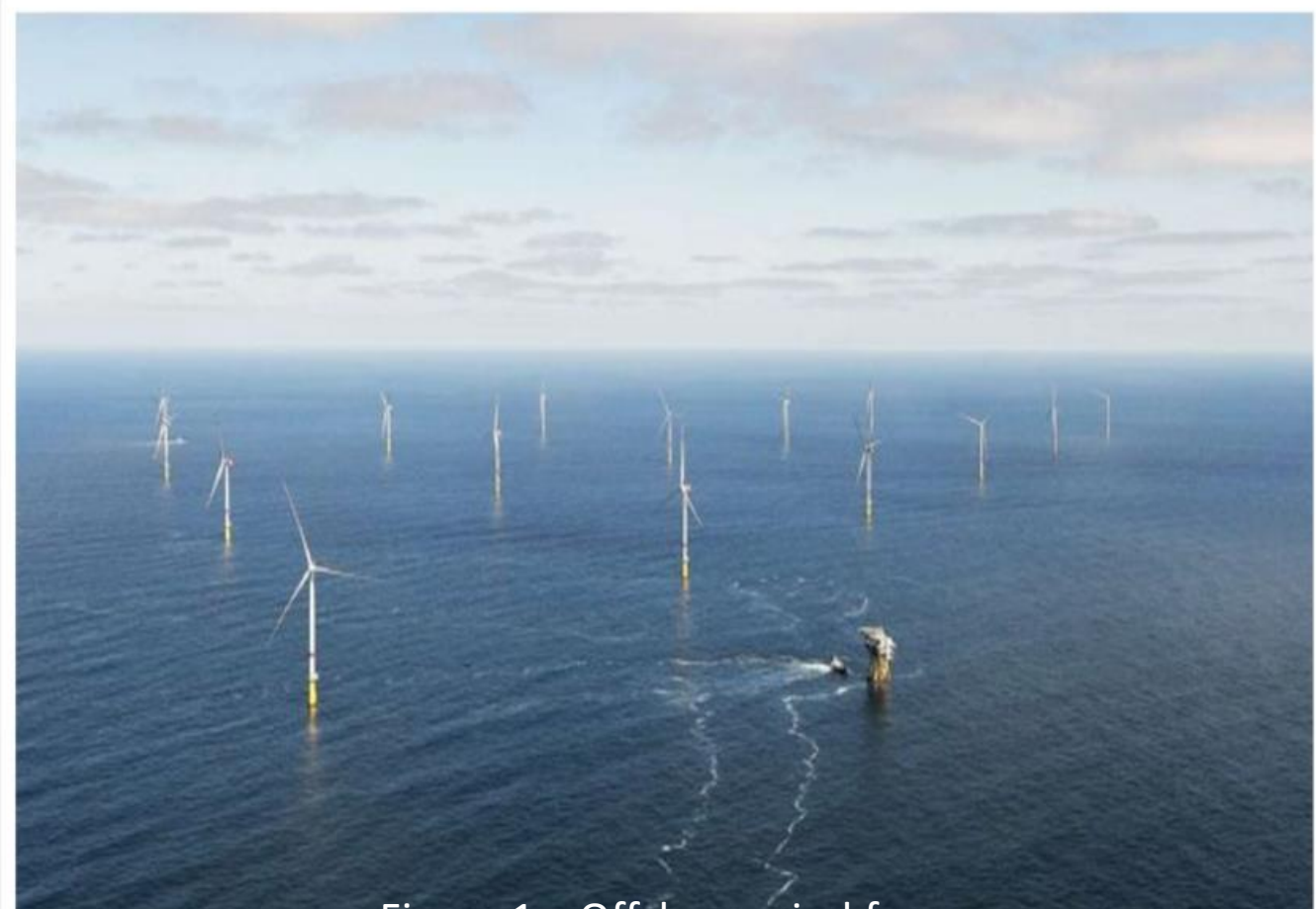
Figure 1 – Offshore wind farms

trend among nations and energy companies to explore and extract these legacy energy sources from offshore locations, as well as initiate new initiatives for offshore wind energy production. However, irrespective of the energy type being extracted or generated, offshore platforms, particularly oil rigs, oil and gas pipelines, and wind farms, remain highly susceptible to potential attacks. The inadequacy of current inspection methods employed for offshore energy resources, including oil rigs and offshore wind farms, is becoming increasingly evident. Considering the significant advancements made in unmanned maritime vehicles and their versatile capabilities in various missions, it is imperative for the offshore energy industry to contemplate the adoption of these platforms as a means to bolster security measures.